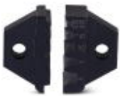
Spare die for CRIMPFOX 6

Replacement die - CRIMPFOX 6/DIE - 1212035