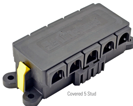
Covered 5 Stud