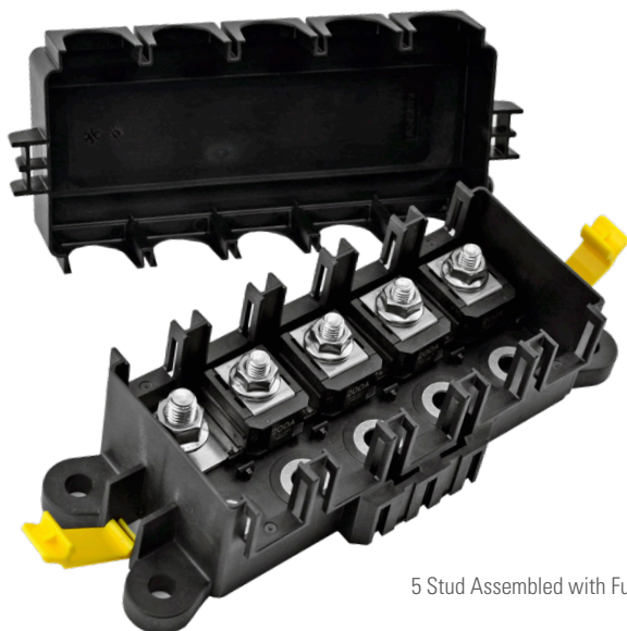
5 Stud Assembled with Fuses