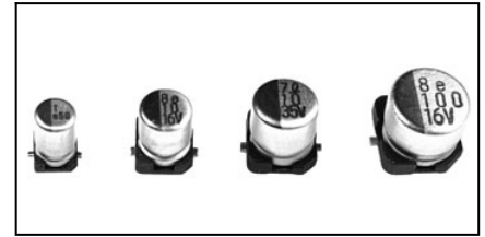
Marking color : Black print