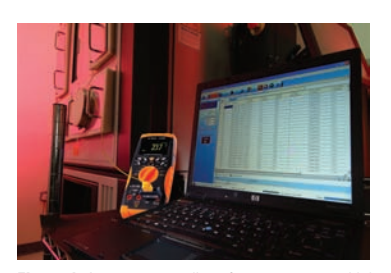
Figure 1: Automate recording of measurements with bundled GUI data-logging software.

Offering the same functionality as the U1252A/U1252B, the U1253A/U1253B is the world's first OLED handheld DMM. You won't have to squint to be sure you're reading it right: On the go or on the bench, you'll get crystal-clear viewing indoors, even in dark, off-angle situations.