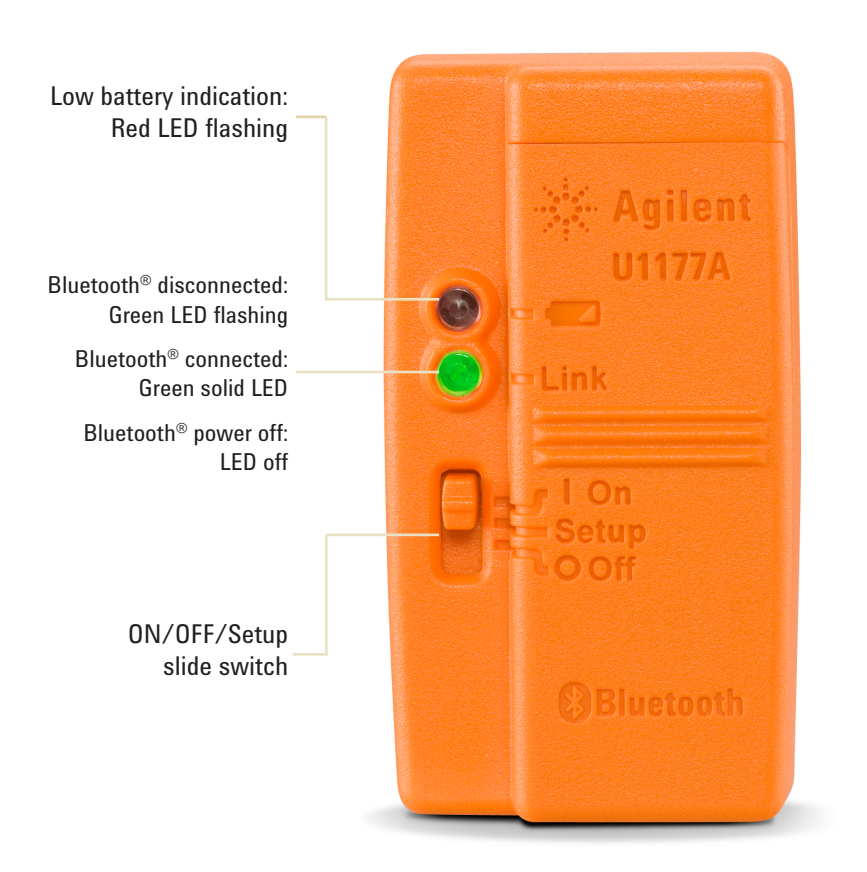
Figure 2. The U1177A as illustrated