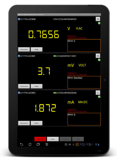
Figure 4. Up to three multimeters measurements with the Agilent Mobile Meter

Agilent Mobile Meter is a free Android application software that allows an Android device to connect, control and perform up to 3 multimeter measurements. Without the need to be physically present at various points, users can now extend their reach to two or three places. This solution allows you to make measurements from a safe distance, eliminates the need to walk back-and-forth between measure target and control points, and monitors multiple measurements simultaneously. Achieve higher work productivity when you use the U1177A with your Agilent handheld digital multimeters.