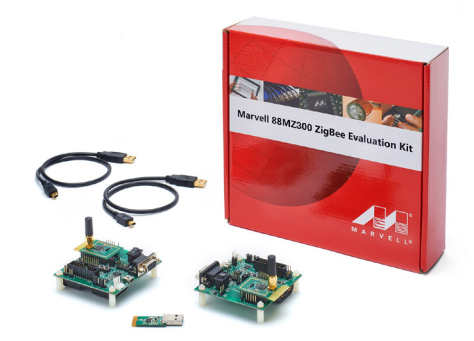
Fig 3. 88MZ300 ZigBee Evaluation Kit

THE MARVELL ADVANTAGE: Marvell chipsets come with complete reference designs which include board layout designs, software, manufacturing diagnostic tools, documentation, and other items to assist customers with product evaluation and production. Marvell's worldwide field application engineers collaborate closely with end customers to develop and deliver new leading-edge products for quick time-to-market. Marvell utilizes world-leading semiconductor foundry and packaging services to reliably deliver high-volume and low-cost total solutions.