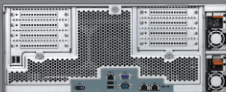
(6) FH/FL PCI-E (G3) x16 slots + (2) FH/HL PCI-E (G3) x8 slots +