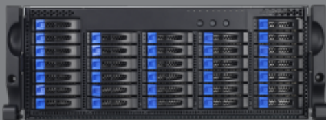
(32) Hot-Swap 2.5" SATA-III/ SAS HDDs