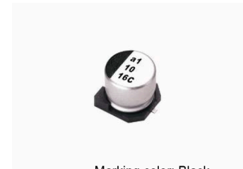
Marking color: Black