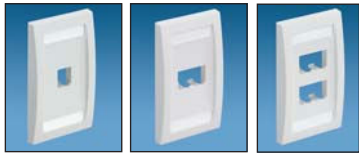
CFPE1IWY CFPE2IWY CFPE4IWY