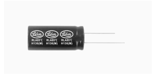
Sleeve & Marking Color: Orange & Black