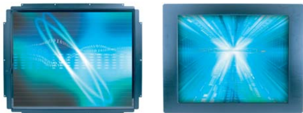
Open Frame Type