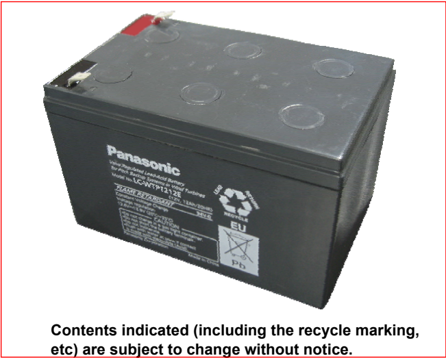
Contents indicated (including the recycle marking, etc) are subject to change without notice.

For pitch backup systems in wind turbines Expected life: 10 years at 20°C, 5 years at 25°C (based on a weekly discharge cycle of max 15 seconds)