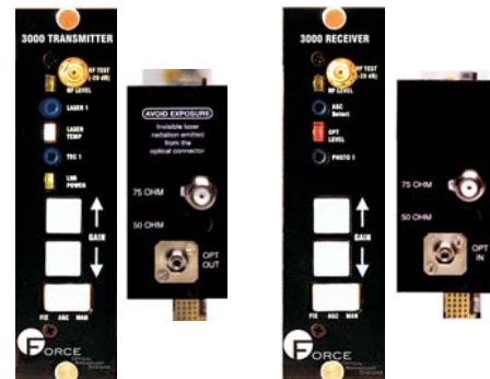
Transmitter and Receiver Front and Rear Views