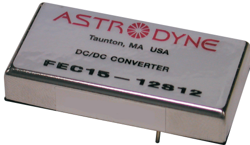
Unit measures 1"W x 2"L x 0.375"H