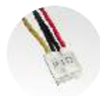
4 pin x 2 Floppy Connectors