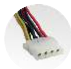
4 pin x 6 Peripheral Connectors