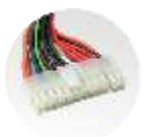
20+4 pin x 1 Motherboard Connector