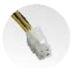
4 pin x 1 CPU+12V Connector