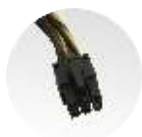
6 pin x 2 PCI-e Connectors