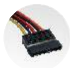
S-ATA x 3 S-ATA Connectors