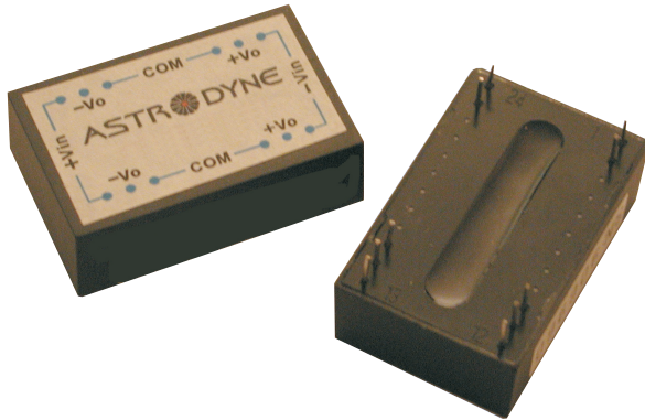
Unit measures 0.8"W x 1.25"L x 0.4"H