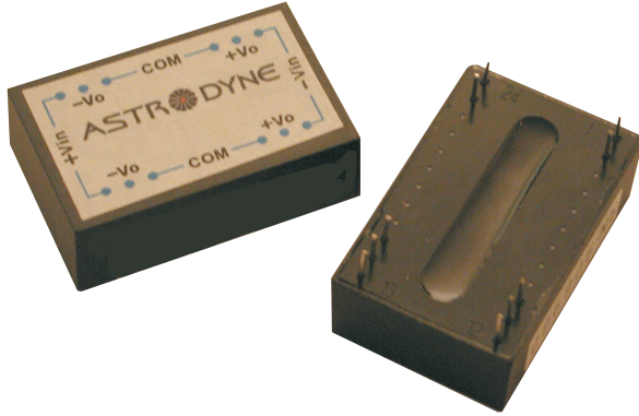
Unit measures 0.8"W x 1.25"L x 0.4"H