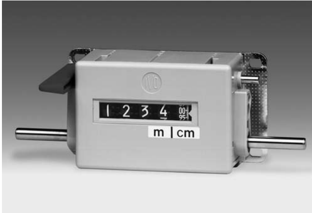
M 410.A - PTB Meter counter