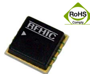
Package : CP-16B