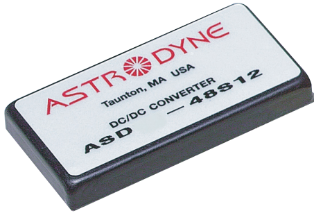
Unit measures 1"W x 2"L x 0.25"H