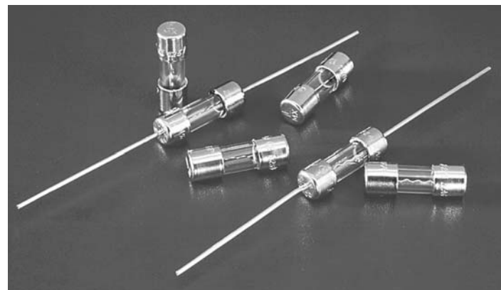
225 000 Series

Contact Littelfuse concerning other ampere ratings.