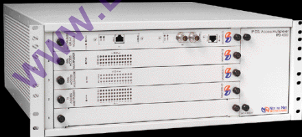
IPD4000 IP DSL Access Multiplexer

Supporting DSL, T1/E1, and DS3/E3 access technologies, the IPD4000 is the optimal line aggregation platform for today's advanced IP-based access networks. CLECs, ILECs, and IP Network Service Providers are able to cost effectively offer high-speed broadband Internet, Virtual Private Network, and Remote LAN services.