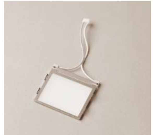
■ Photograph 1 Backlight Designed for Use with the ACX301AK