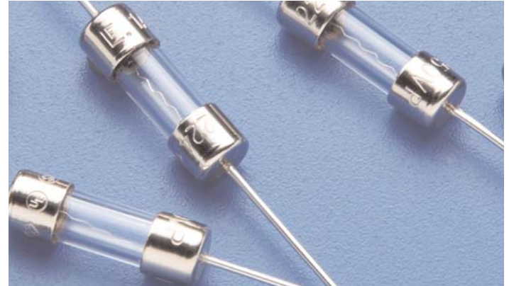
2206 000P Series

Wave solder- 500°F(260°C), 3 seconds Max. Reflow solder- Not recommended