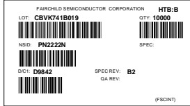
F63TNR Label sample