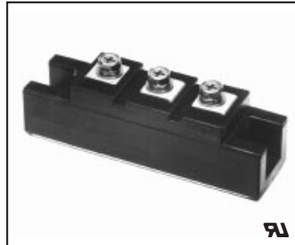
CD411260, CD411660 Dual Diode POW-R-BLOK™ Modules 60 Amperes/1200-1600 Volts